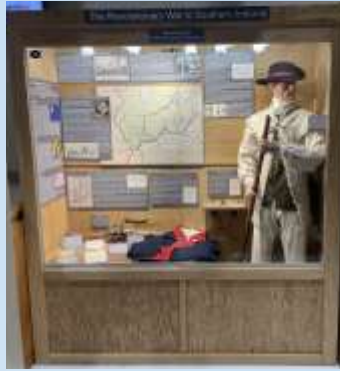
The chapter dedicated the revolutionary war display cabinet at the Evansville wartime museum 4/18/2026