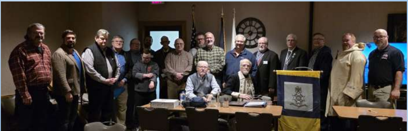
Above: A great turnout for the John Martin Chapter meeting on January 11th