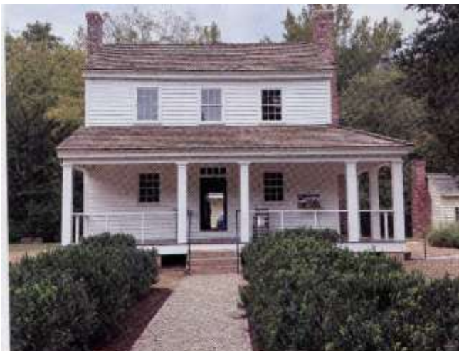
The restored Walnut Grove house following completion of structural stabilization and exterior rehabilitation.

Check further about this event by visiting spartanburghistory.org/sites/walnut-grove .