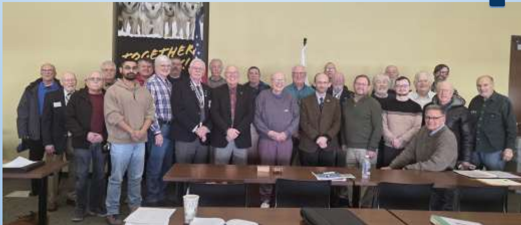
Above: Great attendance at the Duneland Chapter meeting February 7th, 2026.