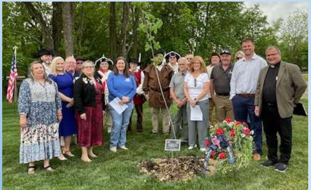
Right: 4/25/2026 The Liberty tree dedication in Vincennes, IN. The tree has been planted in front of the DAR chapter house 8 GRC color guard, the CAR State President and a large group of DAR members dedicated the liberty tree