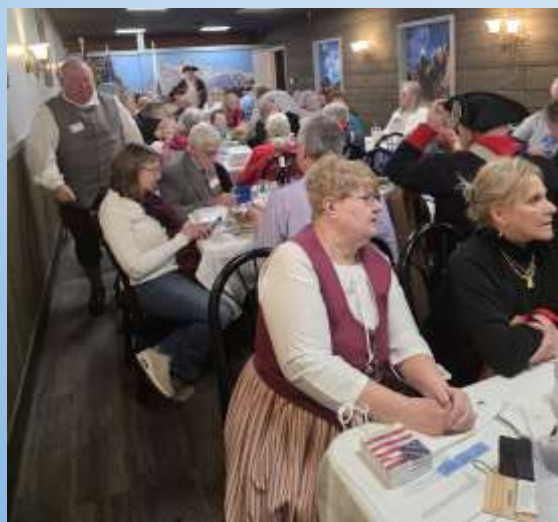
The chapter hosted its 2nd Washington birthday celebration in Terre Haute which was attended by SAR & DAR members and guests