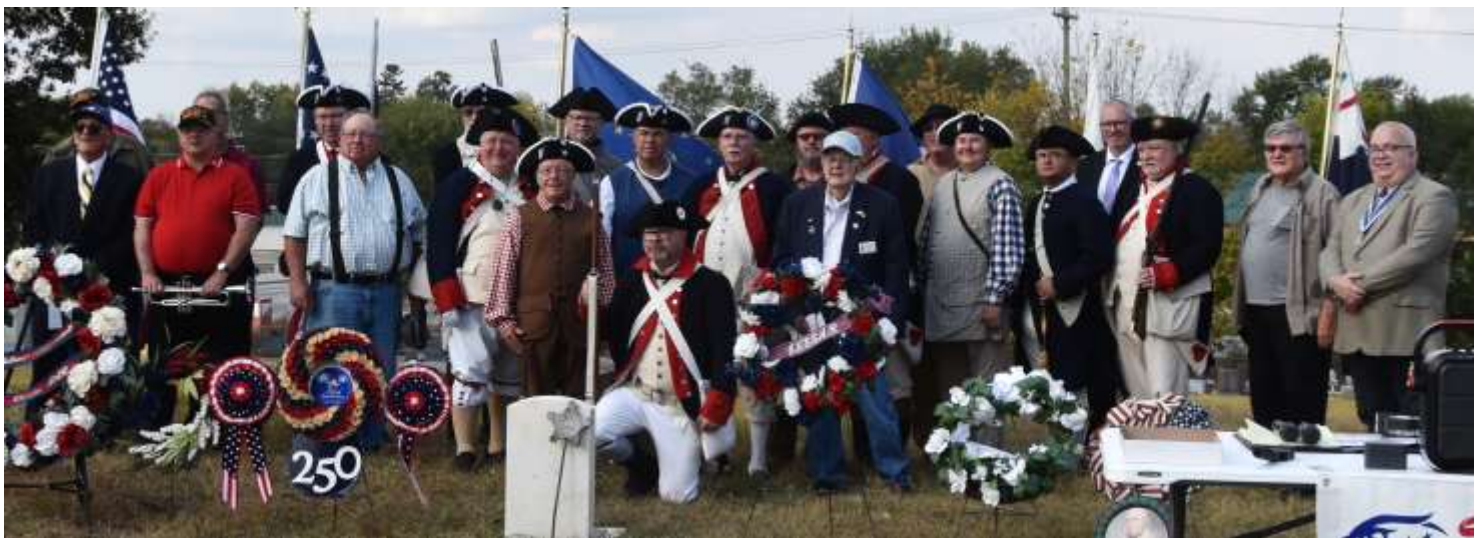
Above: The John Martin chapter hosted the Fall House of Delegates. The chapter hosted a Patriot Grave Marking at the Grandview Cemetery in Terre Haute, IN Photo of the SAR members who attended the grave marking on Oct. 18, 2025