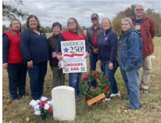
Members of the Dubois county DAR & George Rogers Clark chapter visited all Patriots graves in the county taking pictures & GPS.