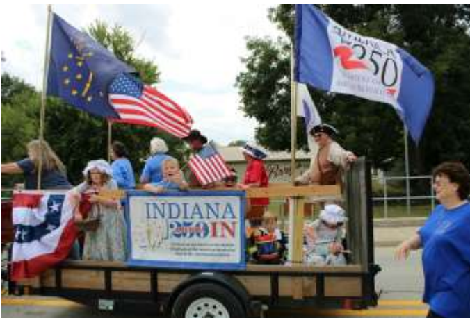
Below: 22 members of the SAR, CAR & DAR marched or road on the float in Monroe City, Indiana September 21st