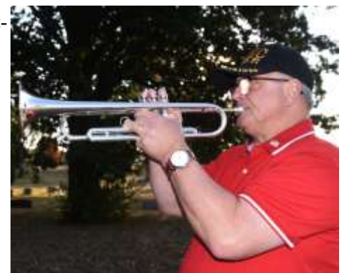
Left: John Martin Chapter Veterans Day parade 2026.