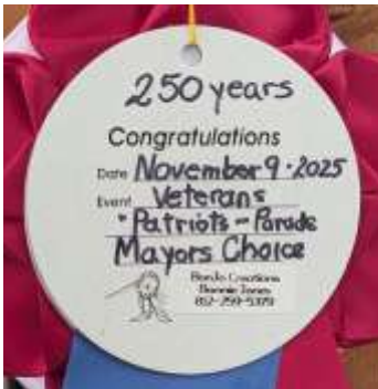
Above and left: Nov 9th, George Rogers Clark SAR & Cradle of Liberty DAR chapter from Pike county won the Mayor's choice