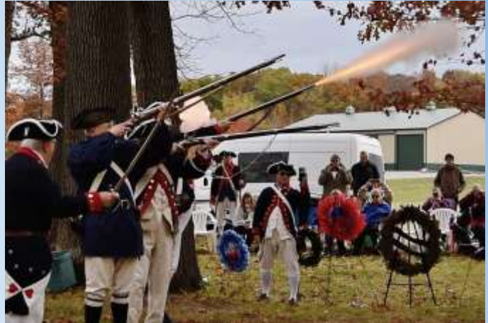
SAR musket salute at the de la Balme ceremony

The Indiana Society of the Sons of the American Revolution participated in the 245th Anniversary Commemoration of Colonel Augustine Mottin de la Balme's Defeat at a marker located at 7175 E Dela Balme Rd. Columbia City, IN 46725 on 1 Nov 2025. The commemoration remembers a military engagement that occurred in Whitley County, IN on 6 Nov. 1780. Little Turtle soundly defeated de la Balme and his soldiers in that fateful battle