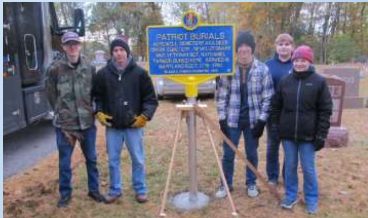
Left: Members of the Ferrier Cadet Squadron, Civil Air Patrol, assisted the Harrison Chapter with the installation of a Pomeroy Patriot Burial Marker at the Deer Creek Cemetery in Carroll County.