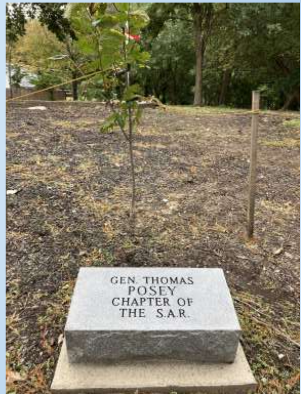
Above: October 25th, members of the General Thomas Posey SAR & DAR chapters planted a Liberty tree in conjunction with the SAR chapter's 40th anniversary