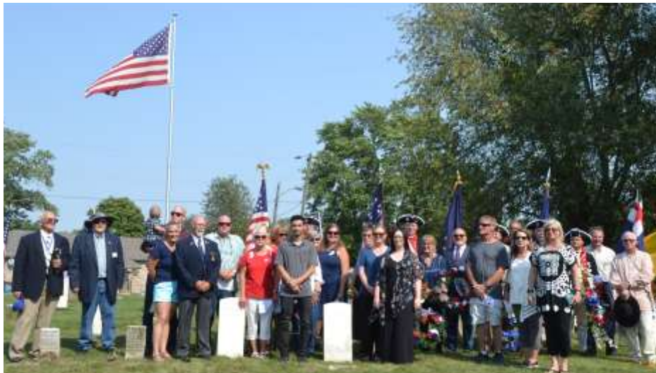
Above: DAR and SAR members who attended