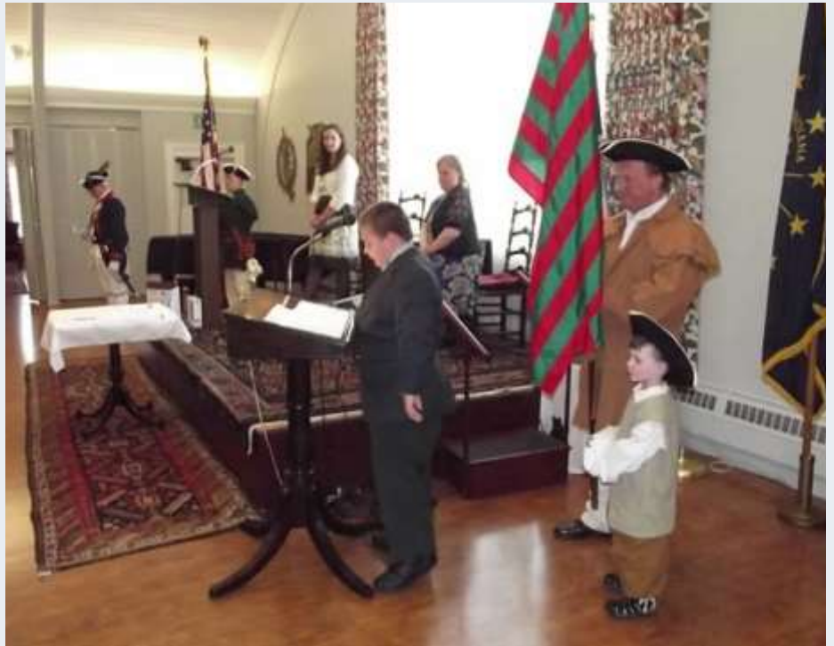
100th Color Guard