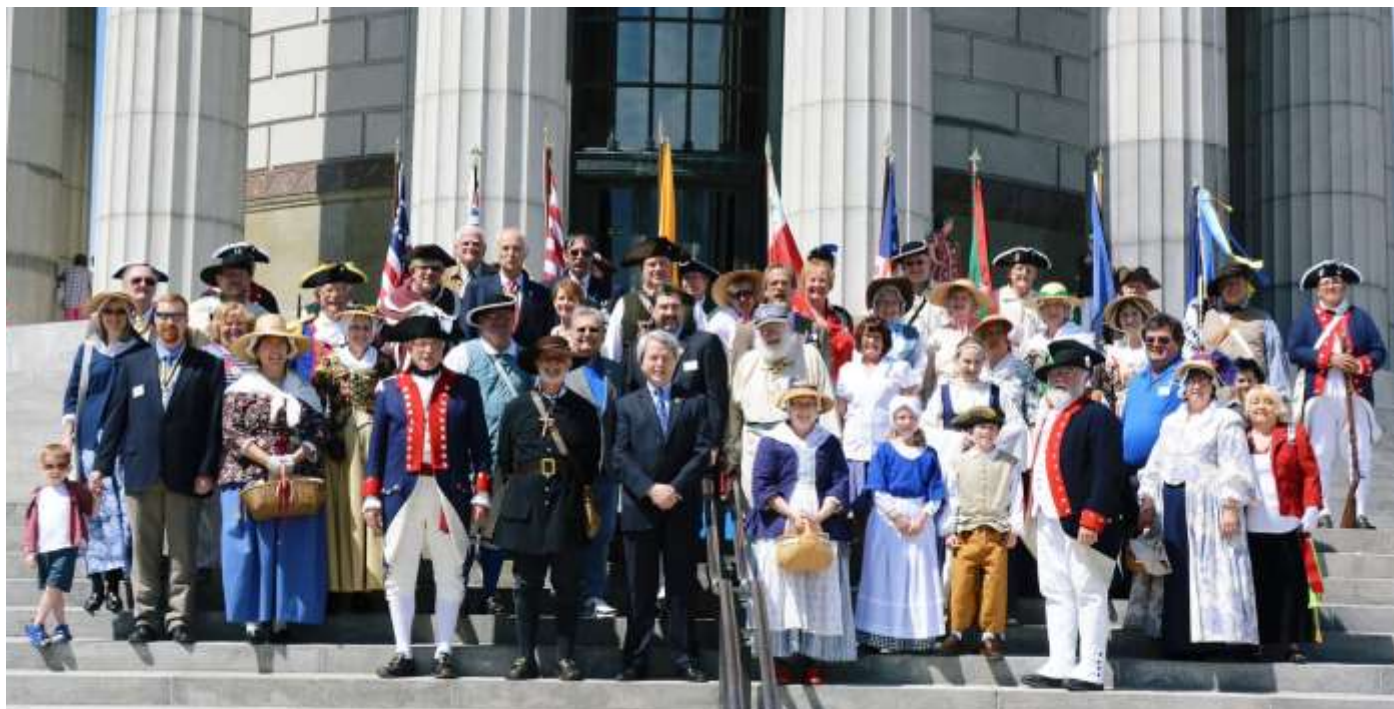
Above: The participants in the May 24th commemoration on the steps of the Memorial. Below: The wreaths placed at the statue.