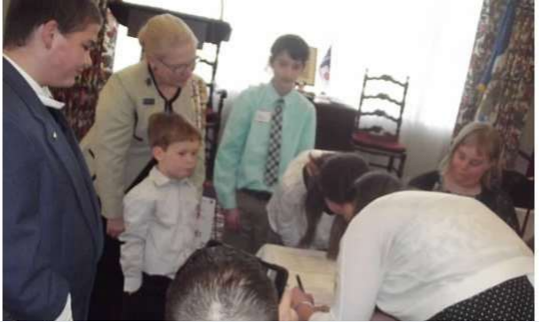
New members signing up